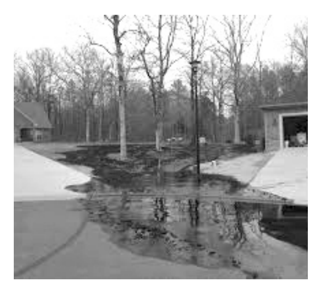
A pipeline spill on March 29, 2013 in Mayflower, Arkansas was an estimated 1 million litres of DilBit.

A decision by the Supreme Court to uphold the right of Canadian cities to pass bylaws to protect residents will change the balance of power in Canada toward more local control. This can pave the way for wider participation in key