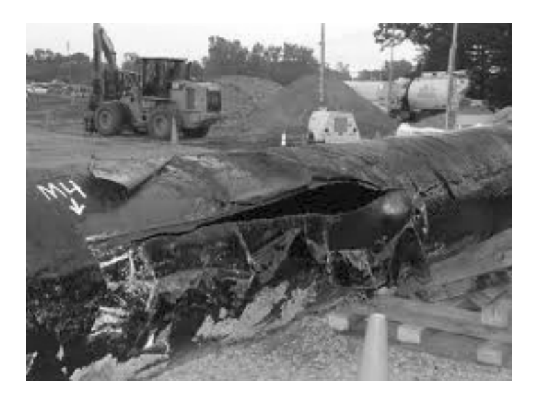
Cleaning up the 2010 pipeline spill in Marshal, Michigan (Kalamazoo) has cost almost $1 billion and is still not finished.

In its October 16, 2013, submission to the National Energy Board (NEB) on Line 9, the City of Toronto cited a Supreme Court precedent ( Spraytech v. Hudson , 2001), "The Supreme Court here refers to the principle of 'subsidiarity' which suggests that local governments, being the closest to the people, should be empowered to exceed not lower national norms" [and cites] "the role of municipalities as 'trustees of the environment'" said City Solicitor Graham Rempe.